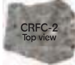
CRFC-2 Top view

CRFC-2 — Filter Skimmer Cover** 5" h x 30" w x 38" l