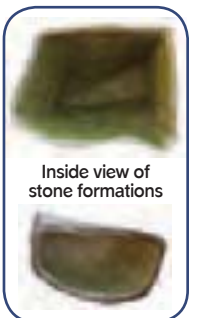
Inside view of stone formations